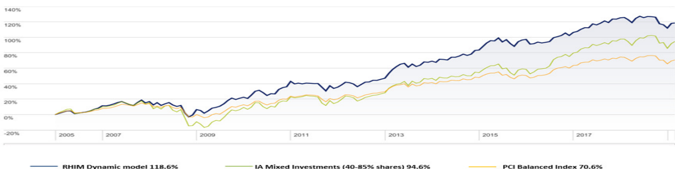
Performance Chart since inception