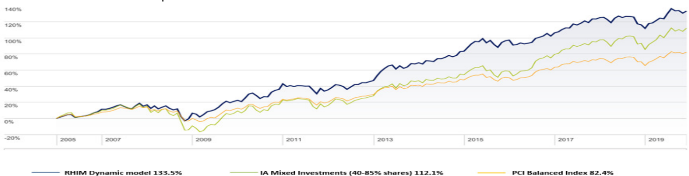
Performance Chart since inception

Richmond House Investment Management Limited (No 114563) is authorised and regulated by the Financial Conduct Authority. Registered in England at Premier House, Argyle Way, Stevenage, Herts, SG1 2AD. Tel 0333 2413350 www.richmondhouseim.co.uk