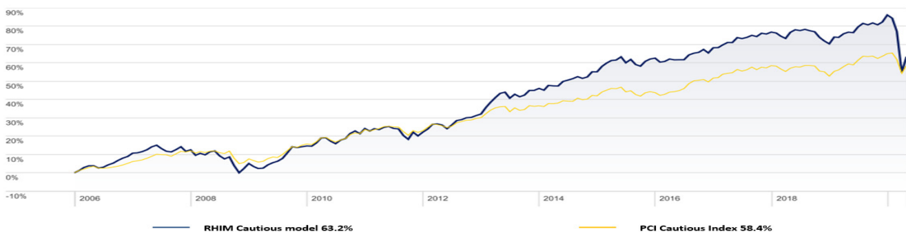
Performance Chart since inception